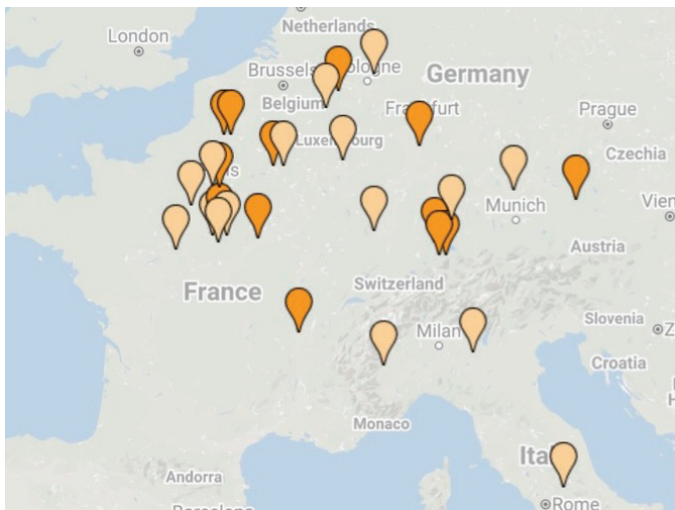
Fig. 1. Geographical distribution of the manuscripts separately transmitting the first book of the Etymologies (dark: precise localization to a specific center, light: approximate localization by region). Made with Google My Maps.

it clear that the first book of the Etymologies circulated separately in the early Middle Ages because it was repurposed as a grammatical handbook. 27 Three of the manuscripts even call it