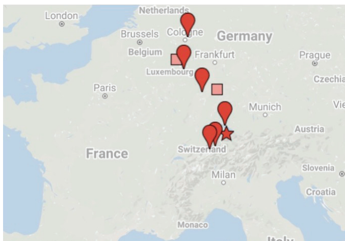
Fig. 3. Geographical distribution of the manuscripts of the St. Gallen redaction (star: St. Gallen, pointer: a known place of production, square: the estimated area of origin). Made with Google My Maps.

manuscripts and one 15th-century manuscript). Altogether, I have identified nine witnesses of the Carolingian redaction dating between the ninth and the fifteenth centuries (see Fig. 3 and the appendix, section c). 57